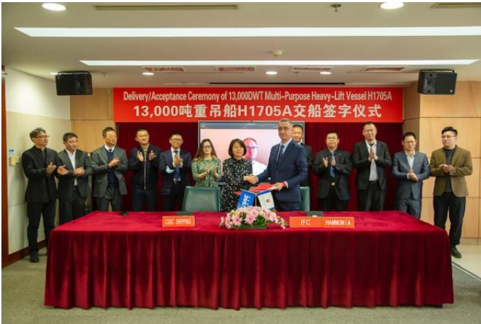
Delivery ceremony at Hudong shipyard in Shanghai, China, 10 December 2021